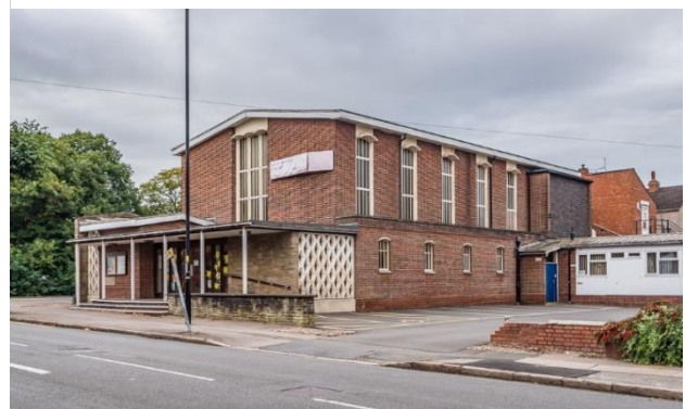
Figure 3: Modern day Hearsall Baptist Church

It should be noted that the modern day Hearsall Baptist Church is not part of this assessment and is therefore not individually assessed. It is within the existing site, to the south of Former Hearsall Baptist church and connects to the former Church by a corridor to at the rear of the car park. The modern day Hearsall Baptist Church (built 1962) can be seen in figure 3.