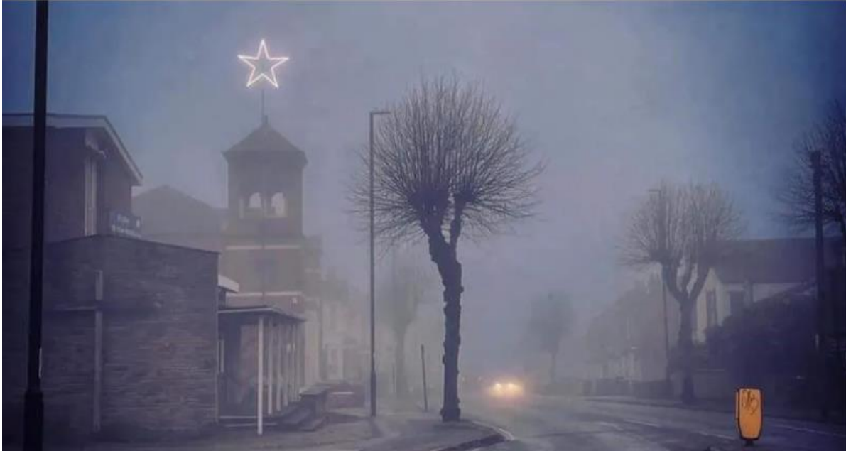
Figure 4:

The star is understood to hold local favour and a local petition was created seeking to protect it