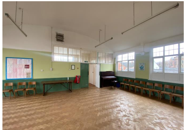
Figure 3: Main stage, ground floor, and upstairs classroom