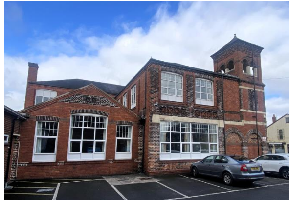
Figure 1: Former Hearsall Baptist Church Hall, Queensland Avenue, Coventry (2024)