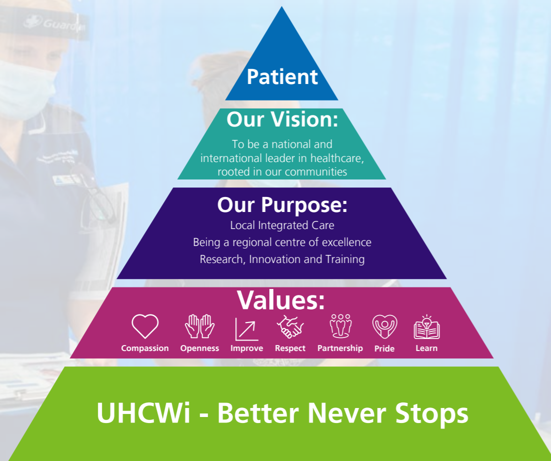
Fig. 2.1 Our strategic triangle

Our commitment to improvement through the use of our UHCWi methodology continues driving us forward as an organisation as we know "better never stops".