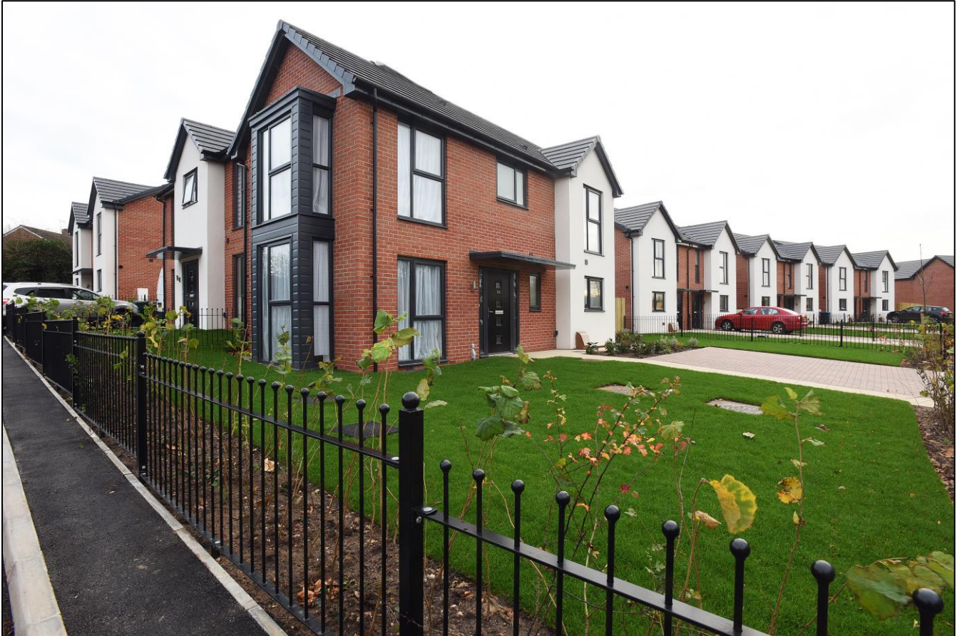
Example of Affordable Housing at Stretton Avenue, Coventry