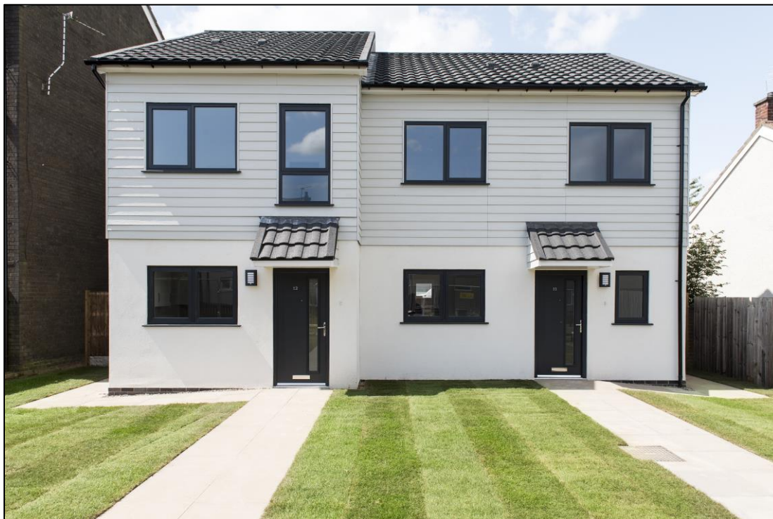
Modular housing delivered at Littlethorpe, Coventry by Citizen Housing

5.23 Although examples of AMC affordable housing are limited in Coventry, there are instances where advanced methods of construction have delivered housing of high and sustainable quality. Citizen Housing have delivered modular homes, a form of AMC, in Coventry, an image of which can be seen below.