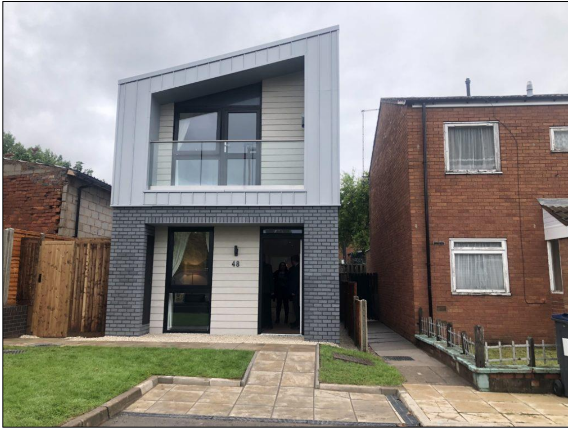
Modular affordable home delivered in Birmingham

5.25 Coventry City Council will encourage proposals to deliver affordable homes via Advanced Methods of Construction, particularly in cases where it can overcome viability issues and contribute towards achieving high performing, energy-efficient homes.