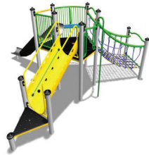
Toddler & Junior Multiplay Unit Playzone 'Two Up Two Down'

Existing 'Waltz' rotator replaced with new Existing 1m high barriers retained